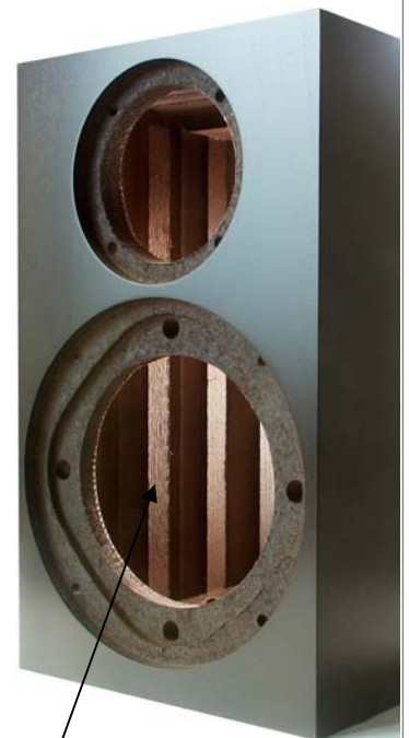
Diffusors They break the sound waves to avoid any echoing inside the cabinet. These do not affect all micro information.

No screw is seen from the outside on the front panel as the drivers are held from the inside. The outer aluminium ring allows a very tight and homogenous fixing of the basket. It facilitates the flow of unwanted vibrations and its curved profile limits the creation of reflections on the outer rim of the basket.